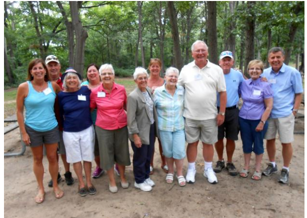
4 th Generation