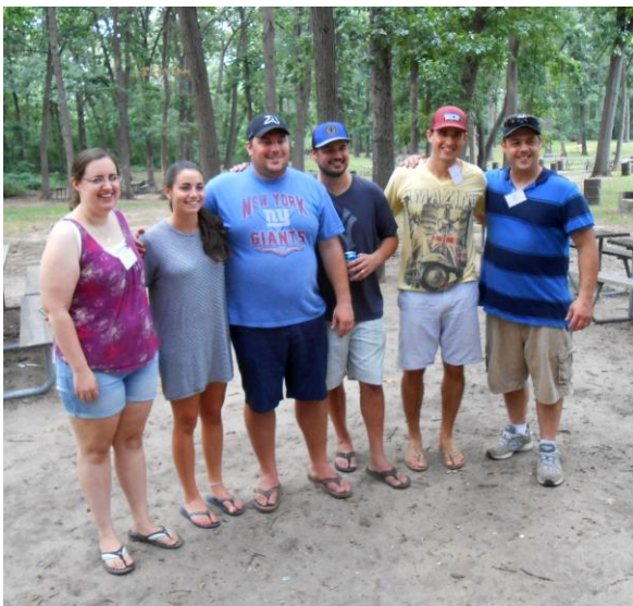
5 th Generation