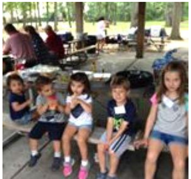
6 th Generation