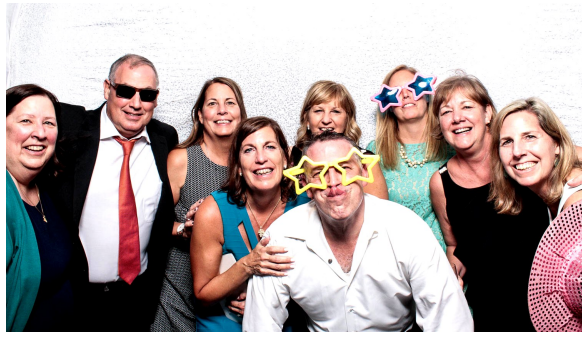
2017: Siblings (See if you can name them)