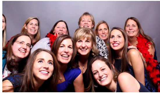
2015: Magee Ladies (See if you can name them including the one half-hidden at the left)