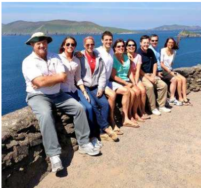
2013: Romanos & Cooks in Ireland