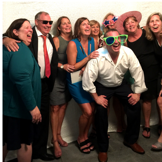
2017: Magee Siblings