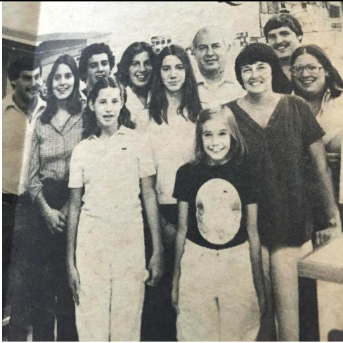
1972: The Store (No Liz)